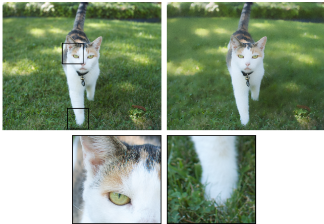
Figure 1: A comparison of our quality-preserving downsampling algorithm (right) with a regular thumbnail (left). The full resolution original image is shown in the cropped inserts below. Note that the cat's face is the only part of the image that is in focus (see detail regions below), a feature that is preserved by our algorithm.

Our blur enhancement produces an image with out-of-focus regions further blurred like Bae and Durand [2007], but it produces a lower resolution approximation at significantly reduced computational cost. Similar to our work, Samadani et al. [2010] developed a method for amplifying specific artifacts present in full-size images to be visible in thumbnail images. However, their method cannot accurately detect motion blur or noise in textured areas.